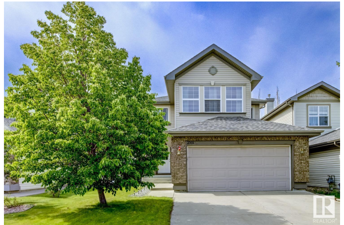
2591 Hanna Crescent NW