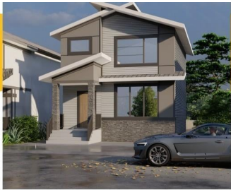
CANNES 1690sq.ft. House Width - 22'