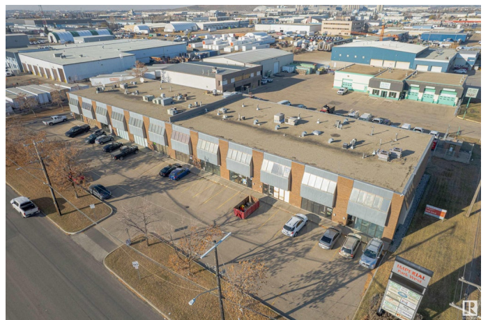
15612 116 Ave NW, Edmonton, AB

Main Floor Exterior Area 1585.08 sq ft Interior Area 1569.02 sq ft